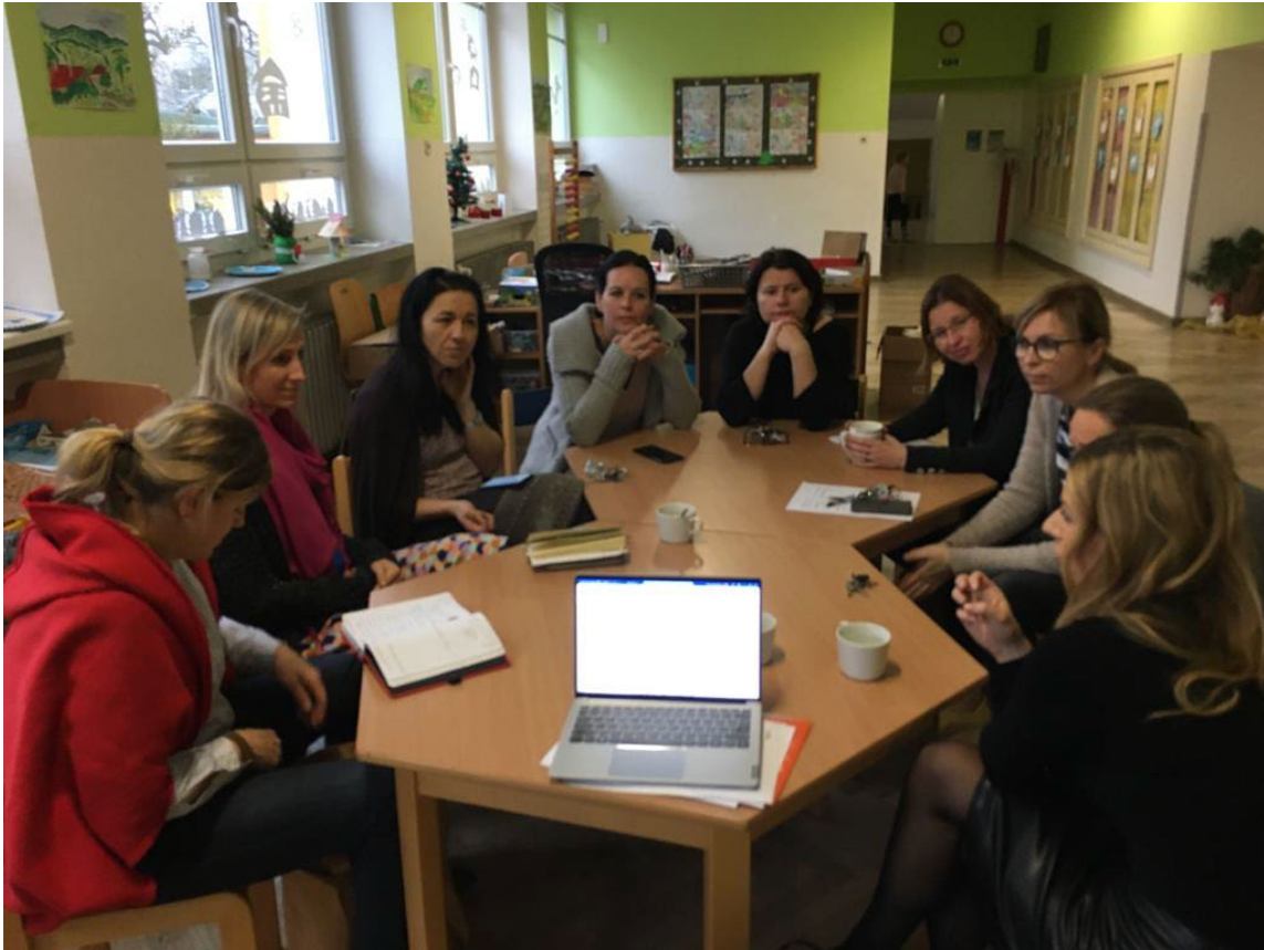
School parliament coordiantors' session, December 2022, Tišnov.