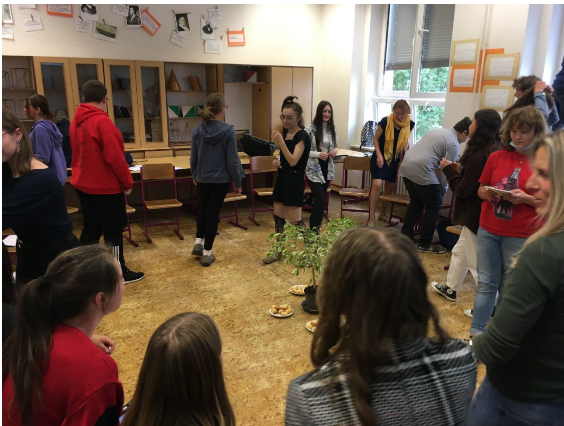
Workshops for school parliaments, October 2020, Tišnov.