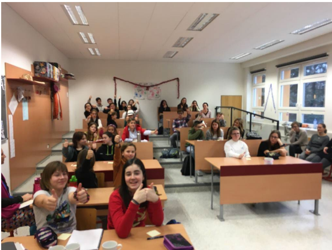
Parliament members' session, December 2022, Tišov.